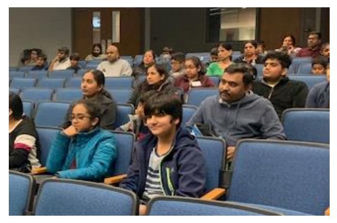
(Talent contest participants at the counseling session)