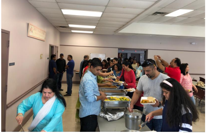
(AIHR Volunteers serving Mahaprasad at Temple for Community Tribute to Indian Martyrs)